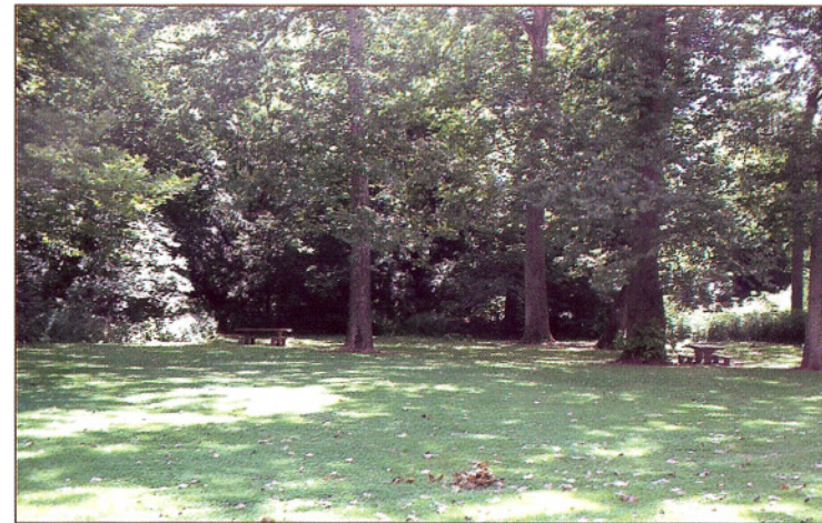
Walk to Great Parks