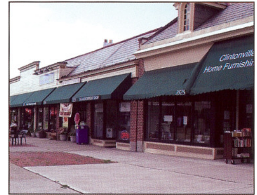
Convenient to shopping